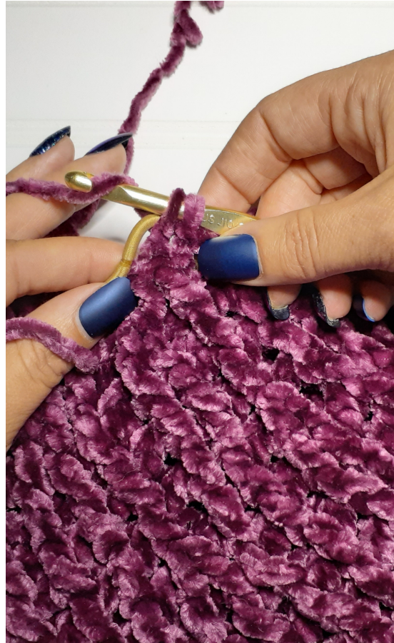
catch hairtie with yarn