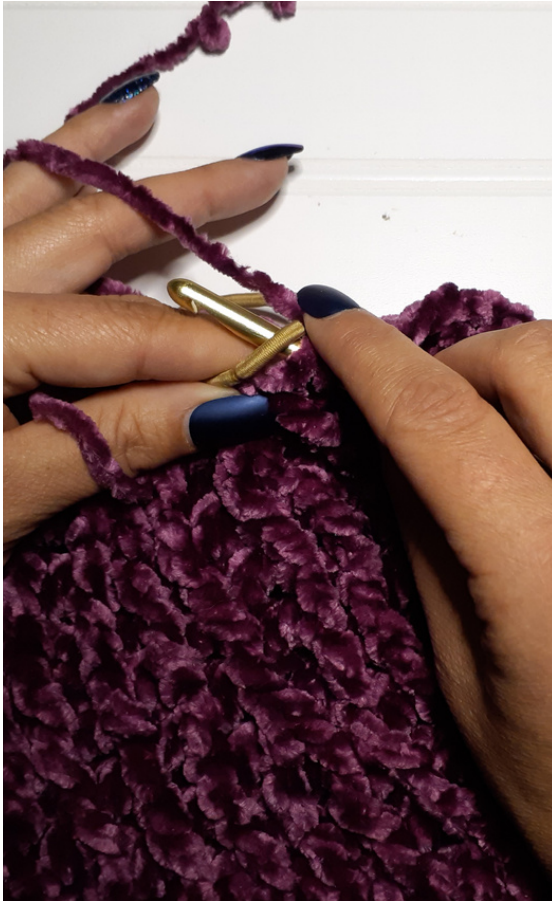
place hairtie over hook