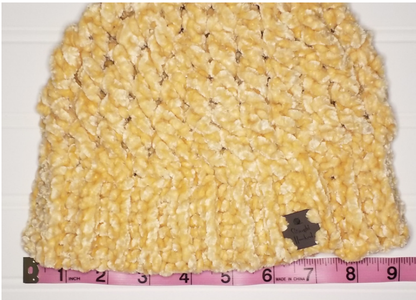
finished size before stretching