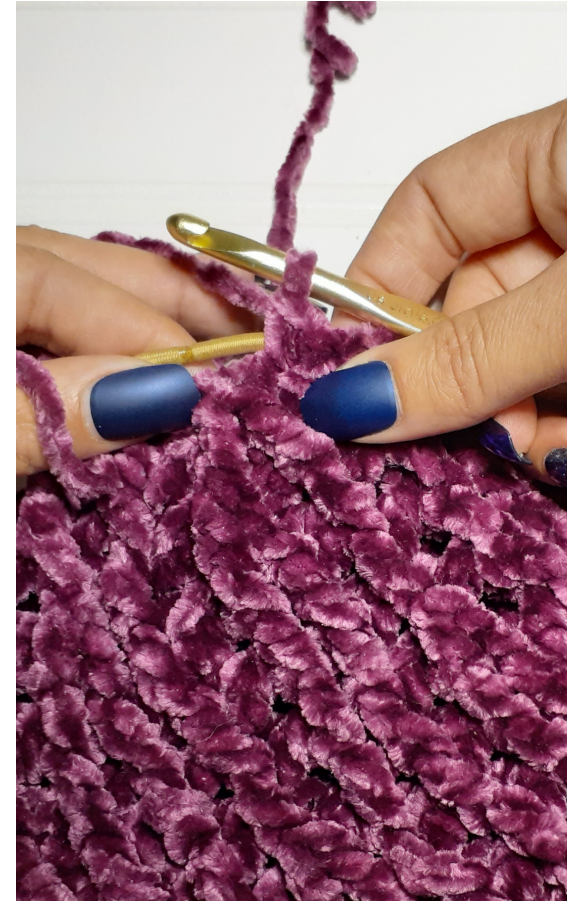
sc around hairtie complete