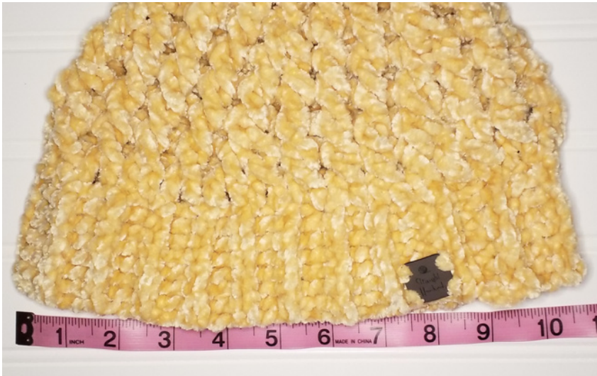
finished size after stretching