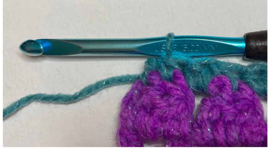
Begin second hdc2tog in the top of the dst, complete in the space between the dst and ch2