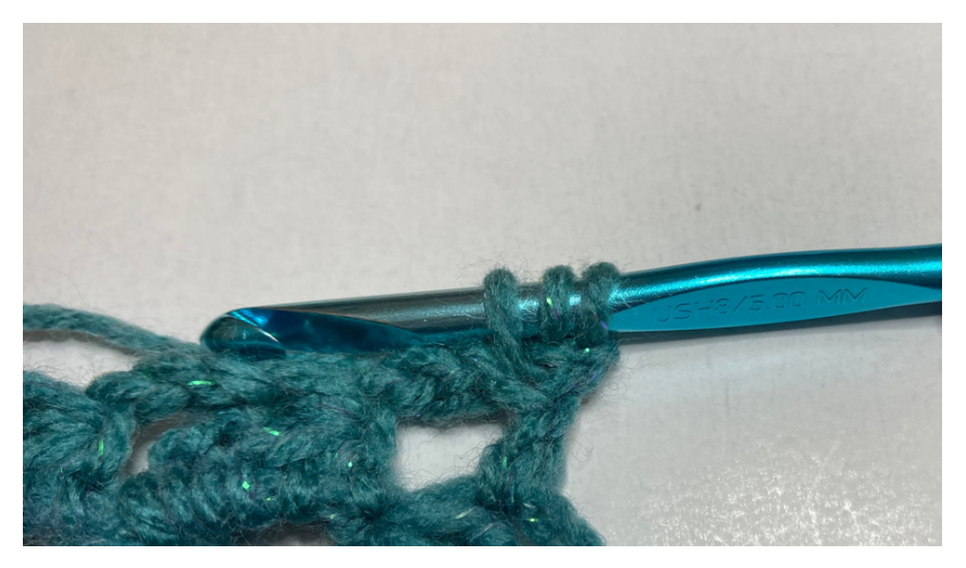
Begin hdc2tog in the top of the dc