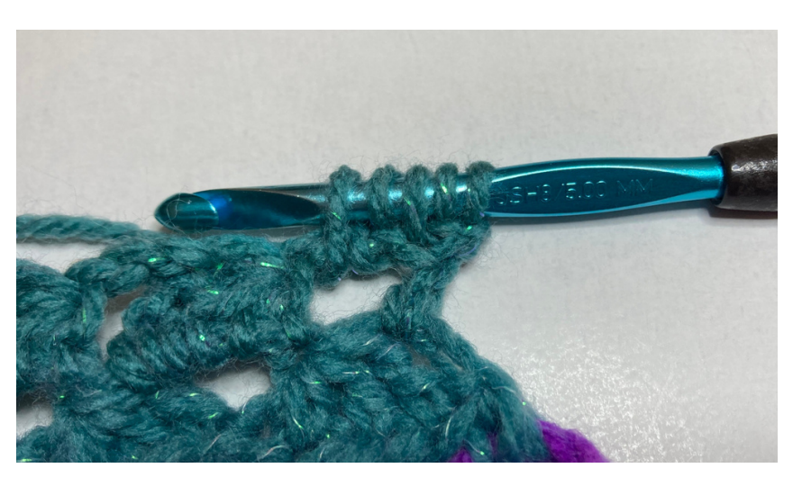
Complete in the ch3 space