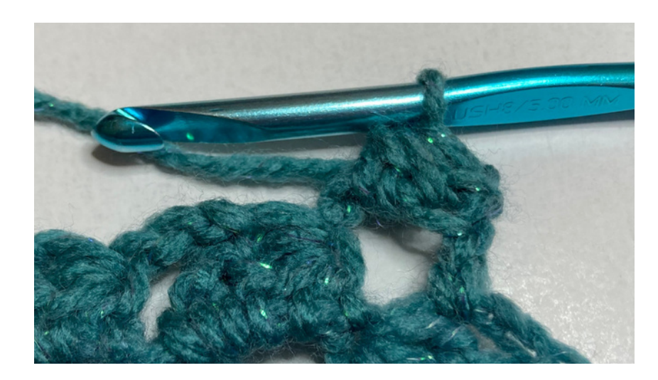
Begin second hdc2tog in the ch3 sp, complete in the "eye" of the stitch, the loop created when beginning your ch3