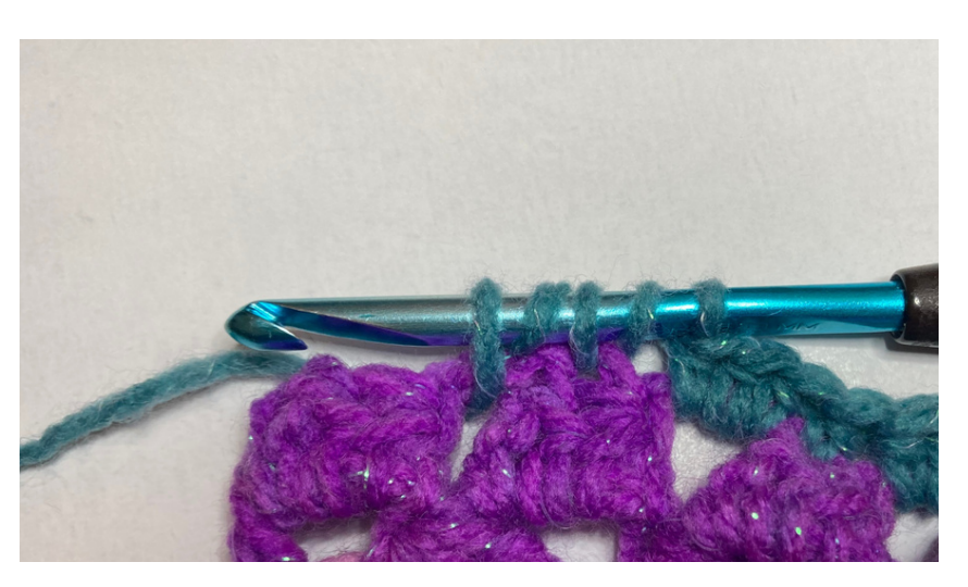
Complete in the ch3 space