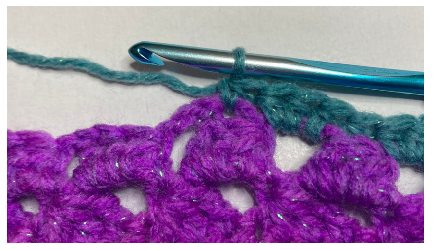
3 hdc in each ch3 space, 1 hdc in the top of the dst