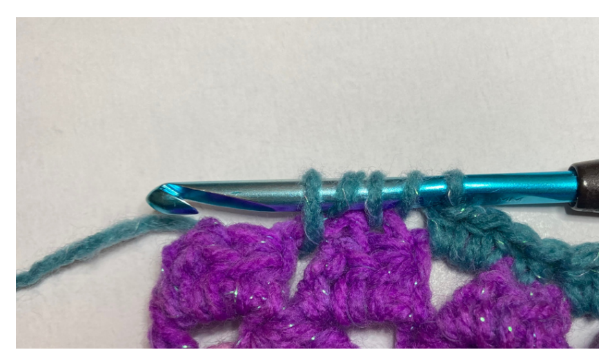
Begin hdc2tog in the top of the dst